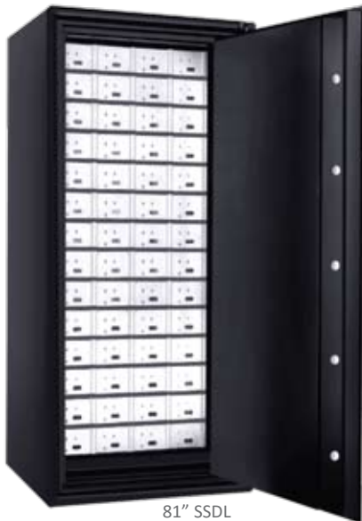
81" SSDL Safe with Safe Deposit Locker